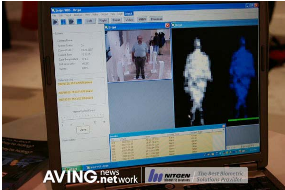
All Visual Internet News of Goods